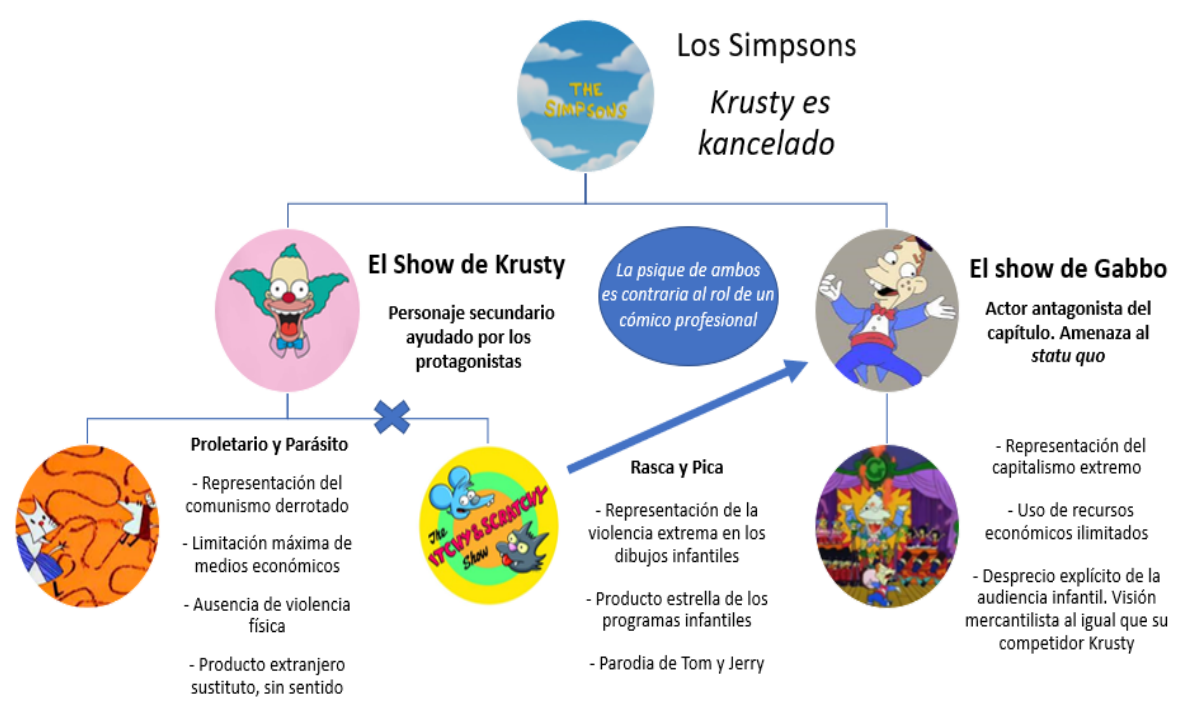
Figure 1 Concept map of the episode Krusty Gets Kancelled