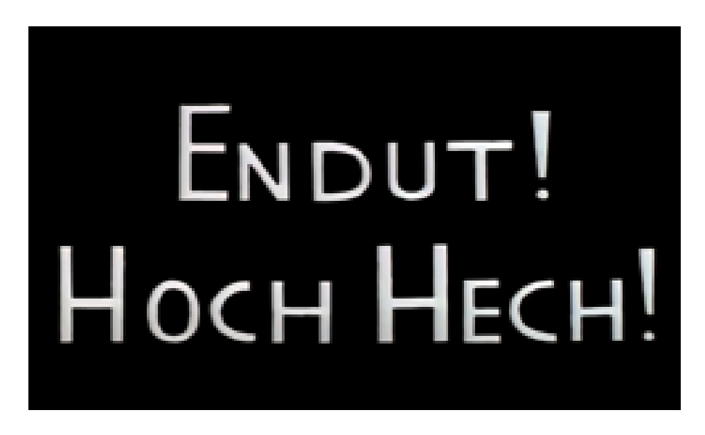
Figure 7 End credits of Worker and Parasite