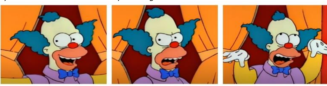
Figure 2 Krusty's different states of mind when presenting Worker and Parasite