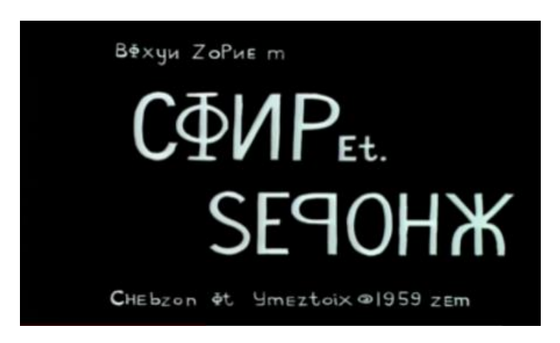
Figure 3 Opening titles of Worker and Parasite