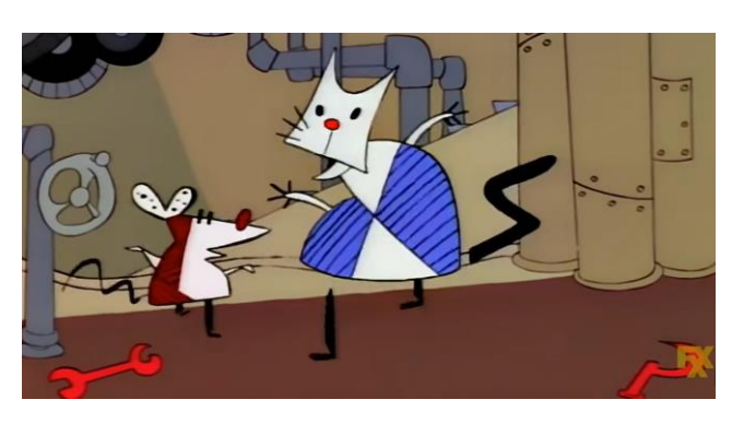
Figure 4 First animated scene of Worker and Parasite