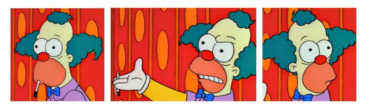
Figure 8 Krusty's emotional reactions after the broadcast of Worker and Parasite