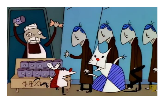
Figure 5 Second animated scene of Worker and Parasite