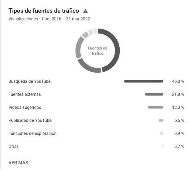
Figure 4. Traffic sources of the "Tu Farmacéutico Informa" channel

type— and reaffirming the use of information consumption that is made on YouTube where the search engine option is quite useful. Mainly due to the link between the main search engine Google and the YouTube social video platform (El Mundo, 2016).