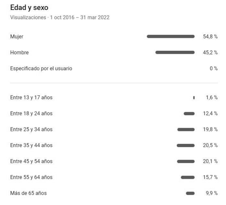
Figure 3. Age and gender of Internet users of the "Tu Farmacéutico Informa" channel.

The profile of Internet users who access the health content of the Tu Farmacéutico Informa channel is mostly female (54.8%) between 35 and 44 years old (20.5%) (Figure 3). This profile is very similar to that established by the INE study in 2021, on Equipment and use of ICT in homes, which shows, in 2021, a greater preference among women for health, educational, and social issues, especially when looking for information on health issues, with 7.4 points more than men.