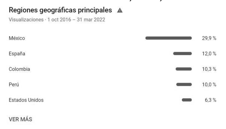
Figure 5. % viewing of the "Tu Farmacéutico Informa" channel by country

Regarding the origin of the views of the channel's videos, Internet users from Mexico occupy the first position, with about 30% of the total views; followed by Spain, 12%; and Colombia, 10%. (Figure 5)