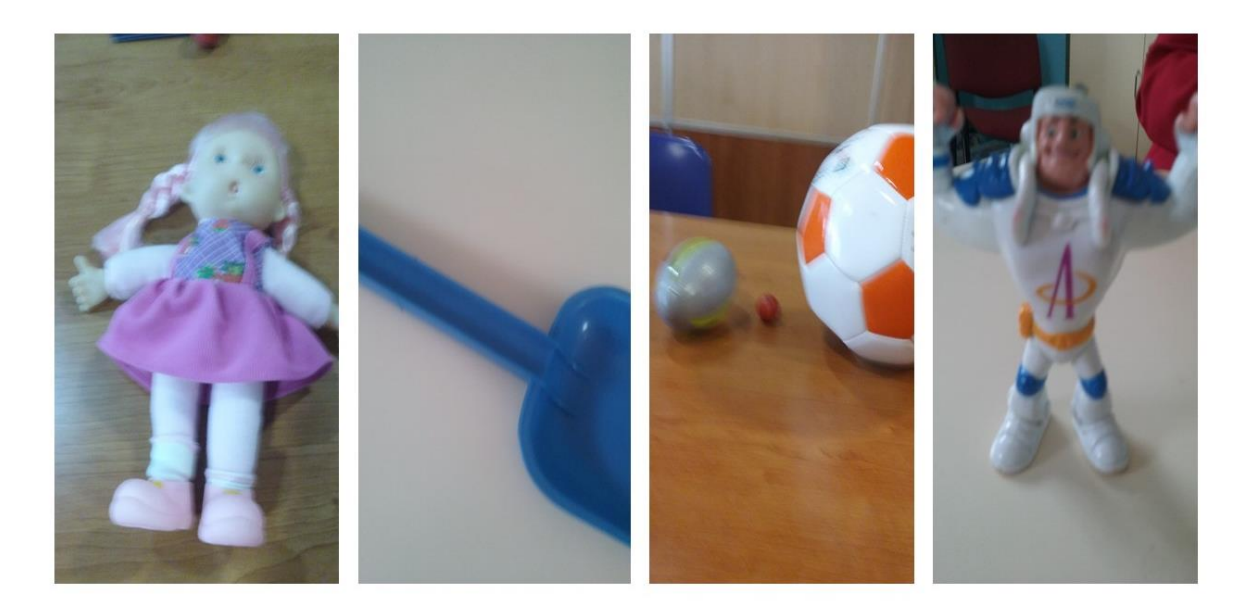
Image 1. Example of photographs taken by children.

A final aspect to be assessed refers to the search for the photographs taken by children on the smartphone. Only 36% of them knew how to find them without the help of the interviewer, and they did so by locating the "Gallery".