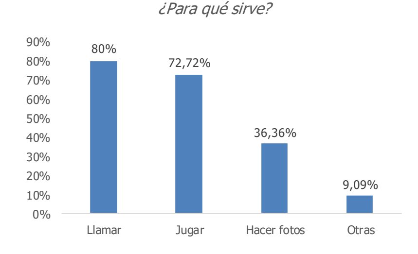
Graph 1: What is it for?

with "Play" (72.72%) or "Take pictures" (36.36%). It is obvious that they understand and associate the main use with the telephone, but they also find it to be an attractive device to play with. Other alternatives such as "See photos", "Download games" or "See audiovisual products" still do not gain relevance among children of these ages, these answers being found only in 9.09% of respondents.