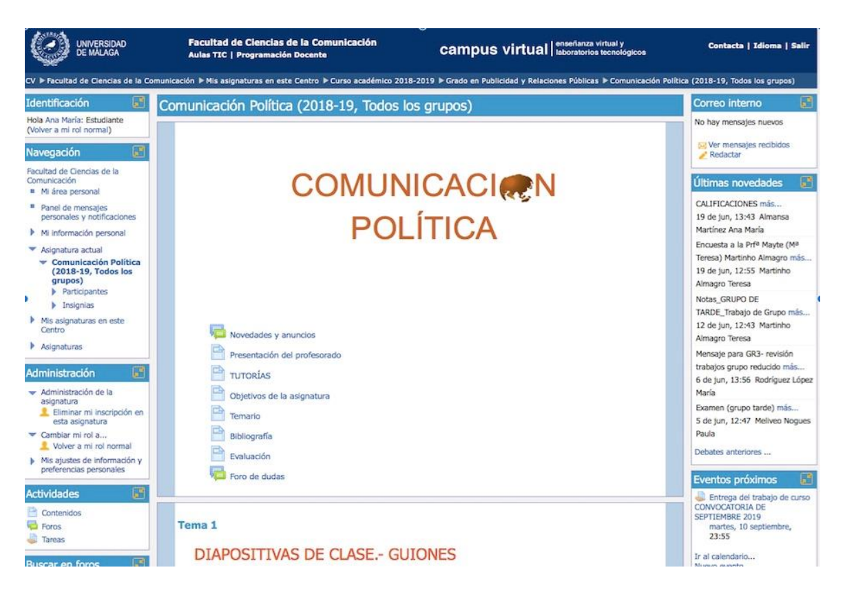
Image 1: Example of a subject in Moodle.

Moodle also offers the possibility to interact through forums, chat and videoconferences. Forums are the most used, both to clarify doubts and to make evaluable exercises. C reports that "in my center we have two weeks of complementary teaching activities, in which there are no face-to-face classes. For those two weeks, we use the forums quite a lot and do exercises like "The perfect exam" or "The trivial of the subject". In these cases, forums are used so that students can ask questions and answers.