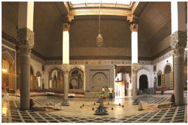
Images 1 y 2. Dar Mnebli Palace, Fez, Morocco. 1. Izd.: Pierre Dieulefils (1914); 2. Right: José Muñoz (2009).